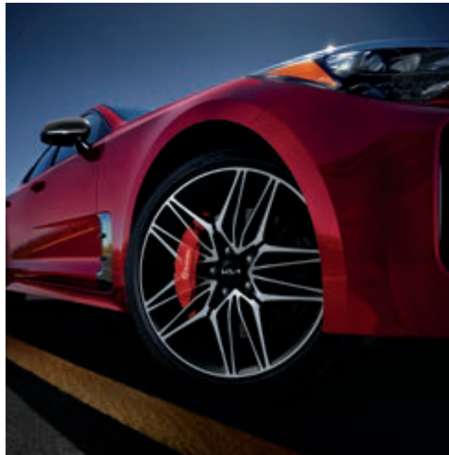
Brembo ® Brakes*